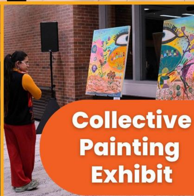
Collective Painting Exhibit