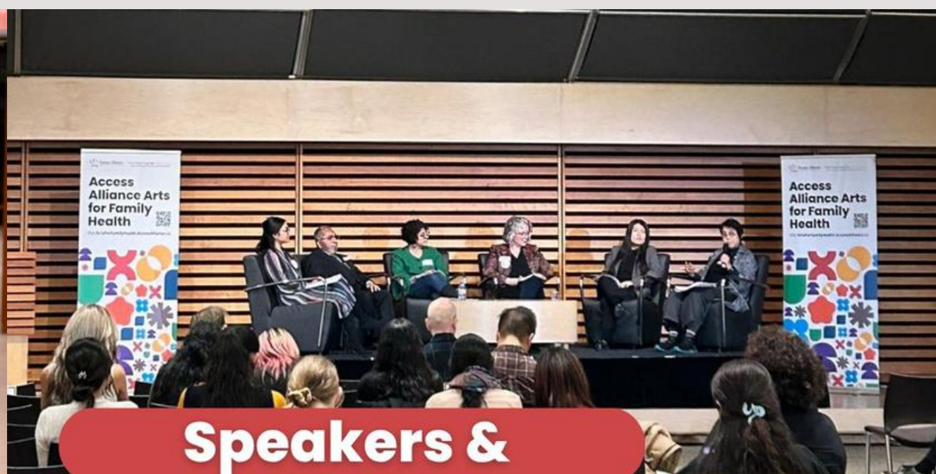
Speakers & Panel Discussion